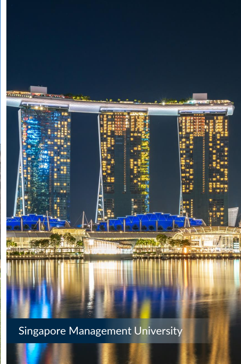
Singapore Management University